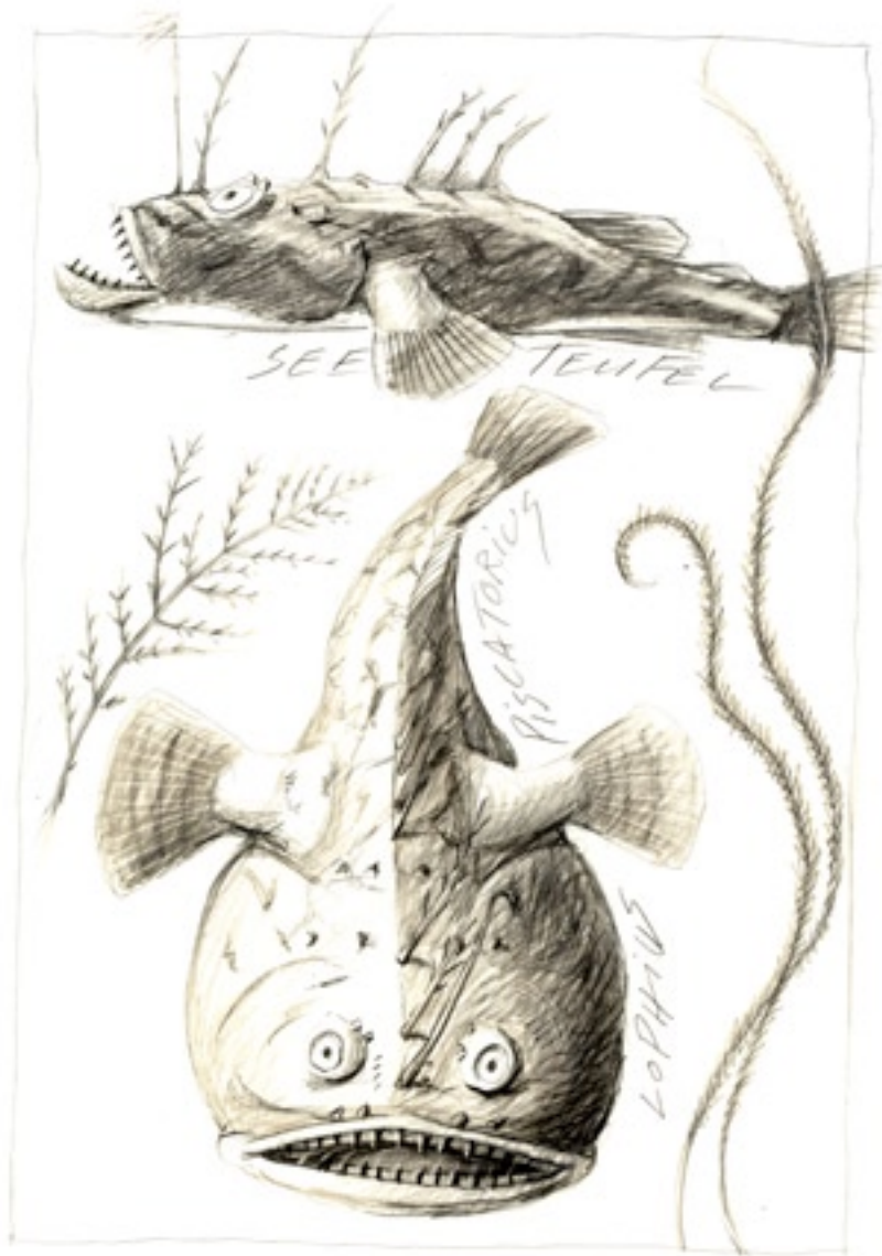
Mord in der Kombüse