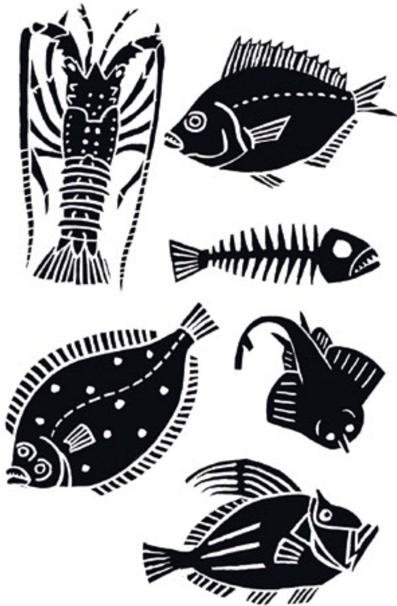
Mord in der Kombüse