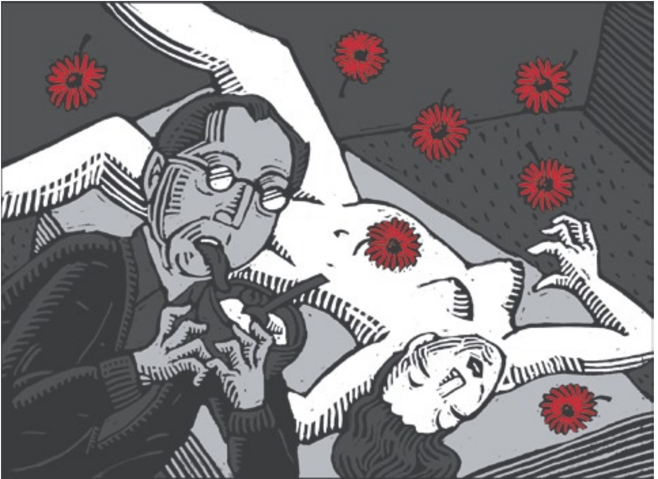
Mord zum Dessert, Gerstenberg