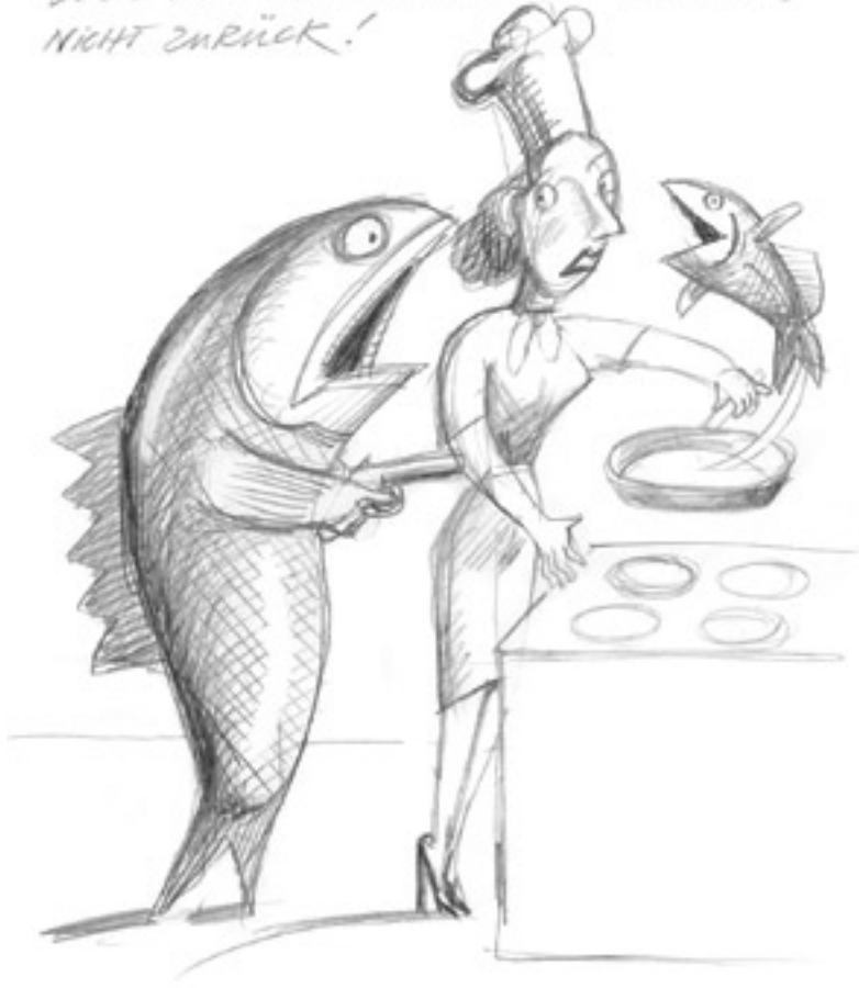
Mord in der Kombüse

SEITDEM DIE FISCHE FERNSEHEN HATTEN, SCHRECKTEN SIE VOR ERPRESSUNG, MORDDROHUNG UND STÄNDIGEN ANSCHLÄGEN AUF UNSCHULDIGE KÖCHE, DIE NUR DAS BESTE AUS IHNEN MACHEN WOLLTEN, NICHT ZURÜCK!