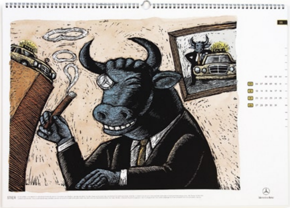
Mercedes Taxikalender 2002