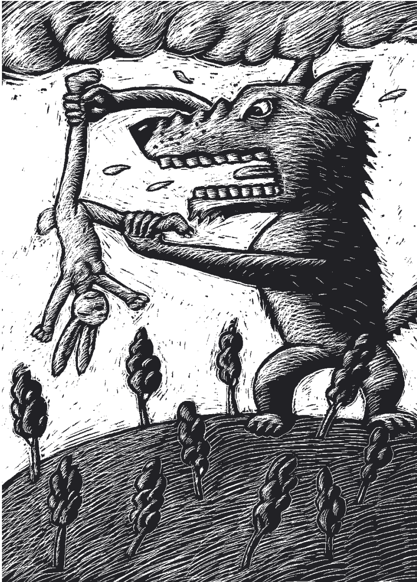
Mord im Grünen, Gerstenberg