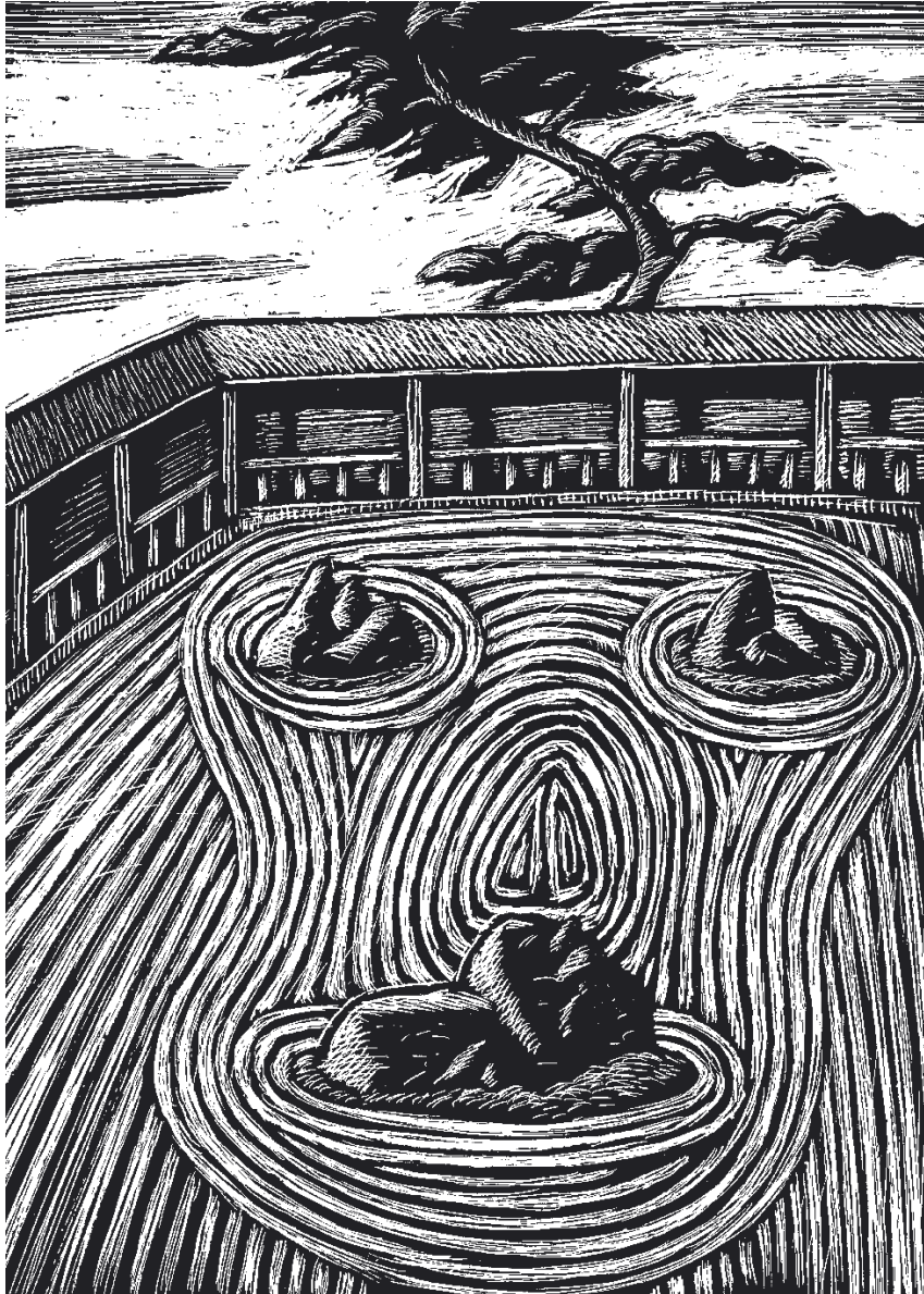
Mord im Grünen, Gerstenberg