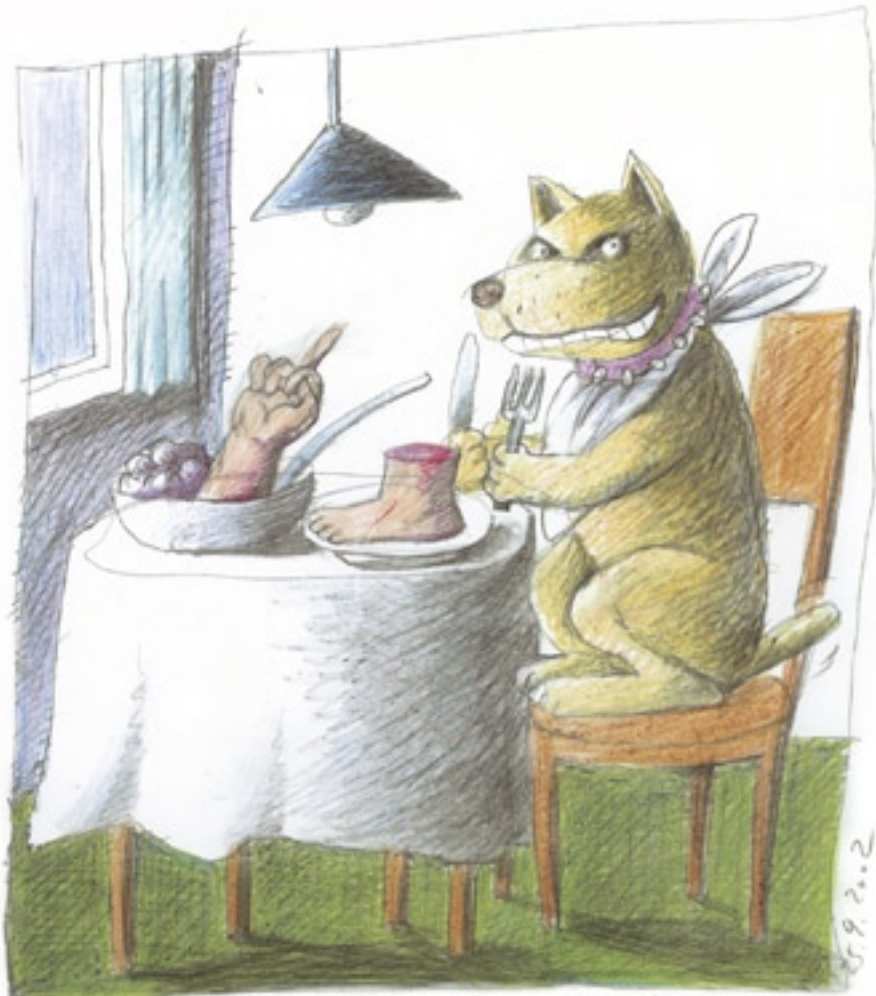
DER WENIGER ZUGENE KAMPFHUND UND SEIN HERRCHEN