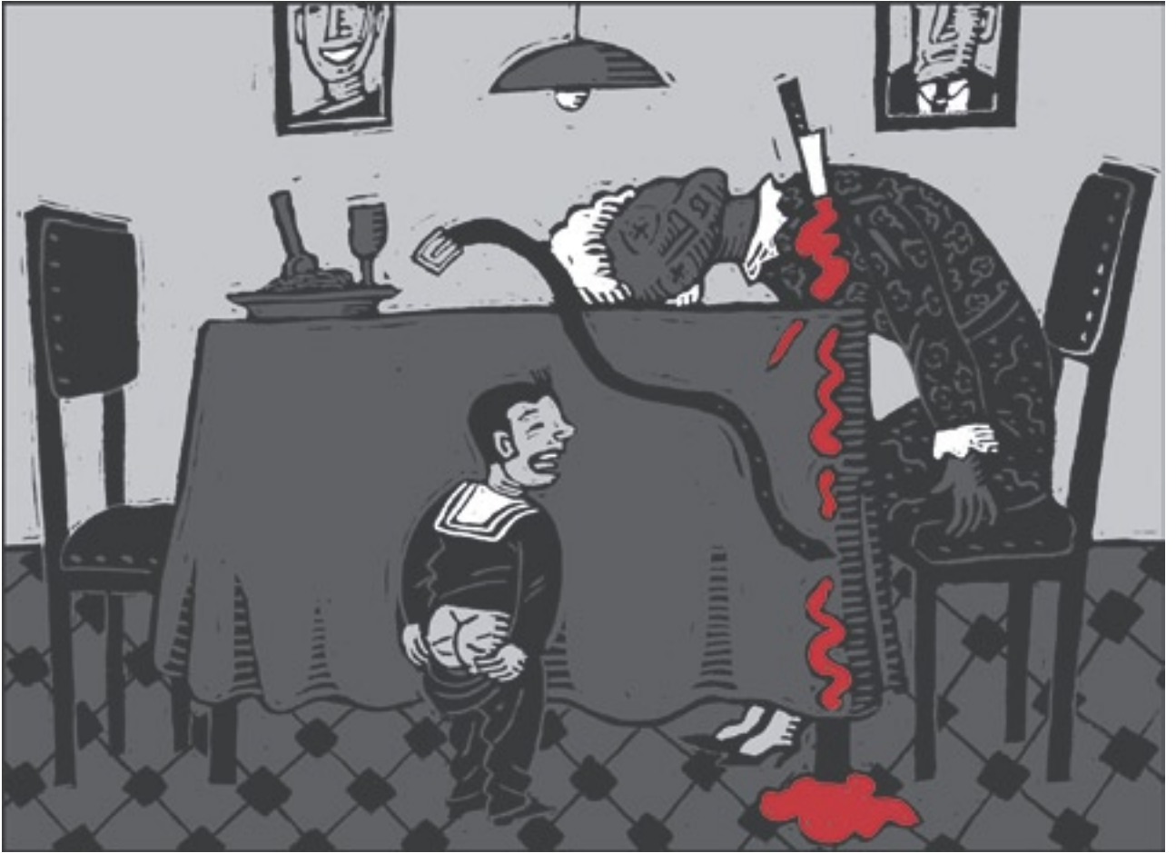
Mord zum Dessert, Gerstenberg