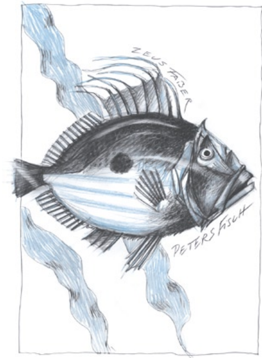
Mord in der Kombüse