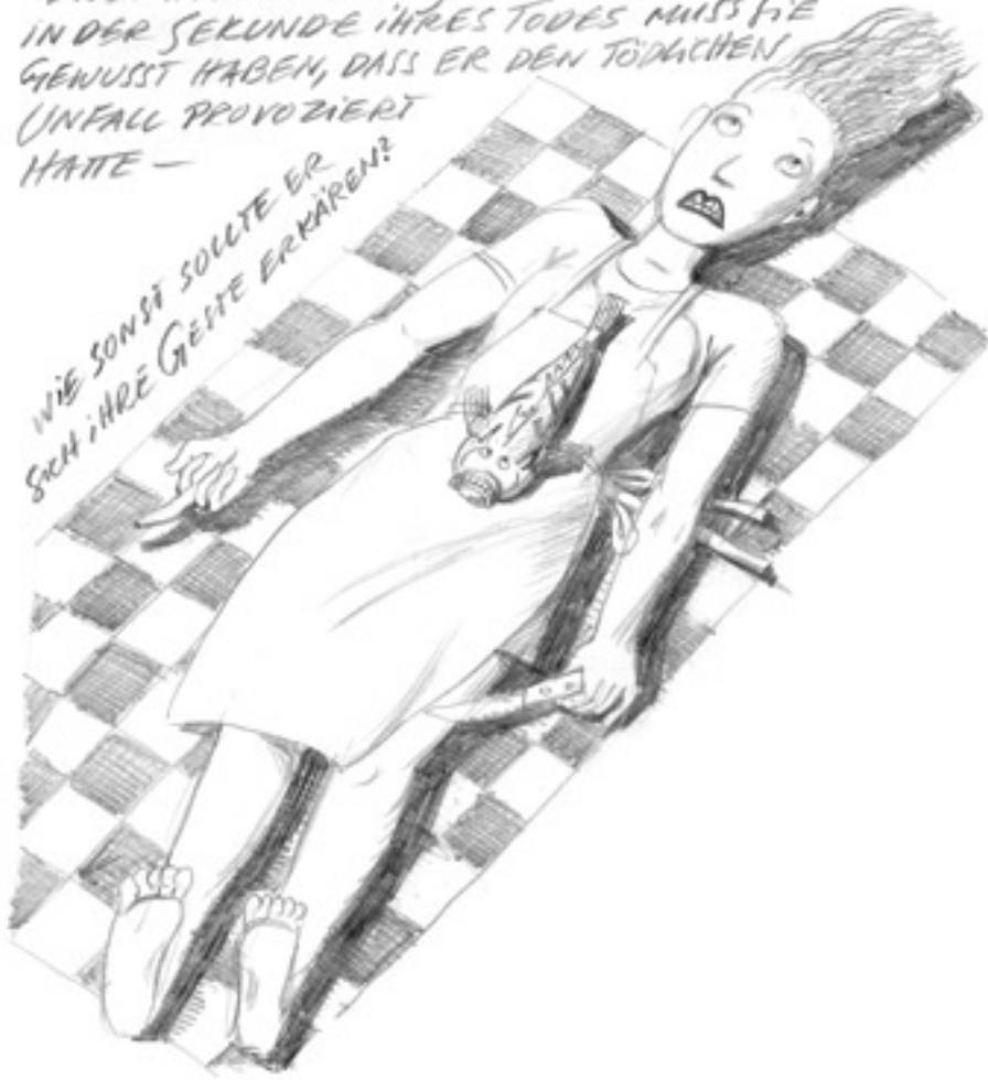
Mord in der Kombüse

WIE SONST SOLLTE ER SICH IHRE GEFÜHLE ERKÄREN?